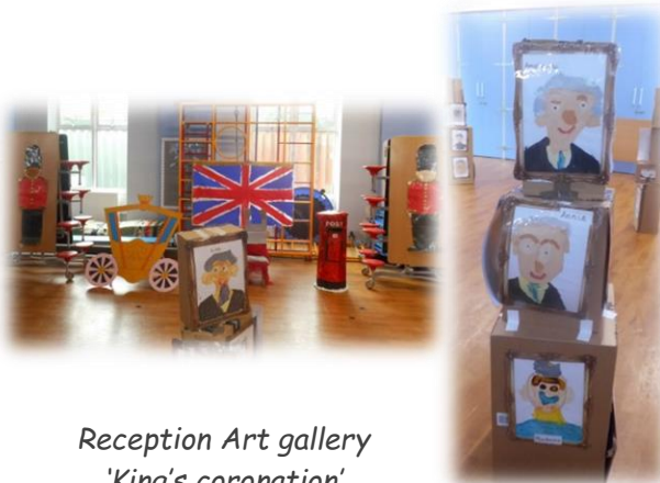
Reception Art gallery 'King's coronation'

Moat Farm Infant School Brookfields Road Oldbury West Midlands B68 9QR