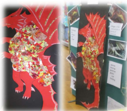
Year 2 Art Dragon Exhibition

Moat Farm Infant School Brookfields Road Oldbury West Midlands B68 9QR